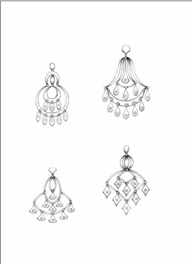
Studies for jewellery (Fabio Neri)