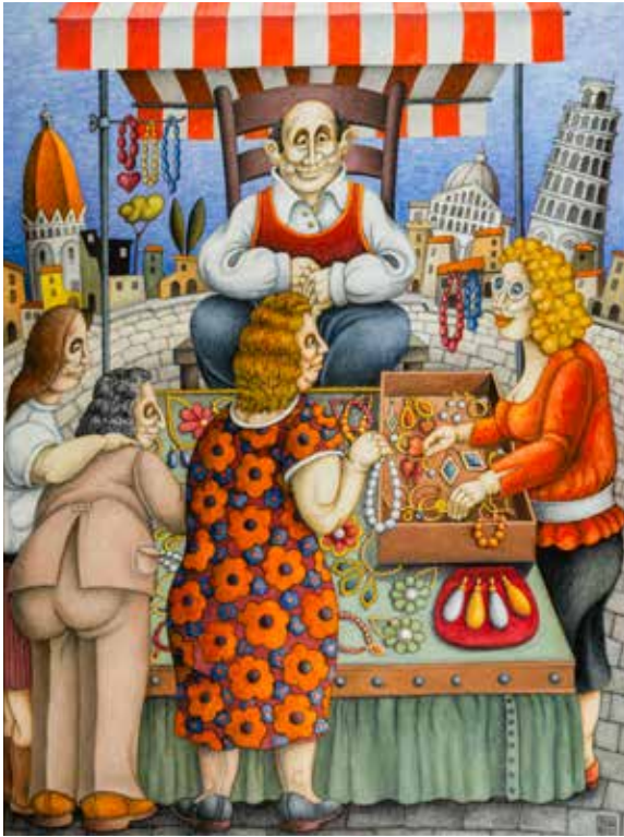
Venditore di gioielli (Jewellery Seller), 2002 oil on canvas 30×60 cm (Fabio Neri)