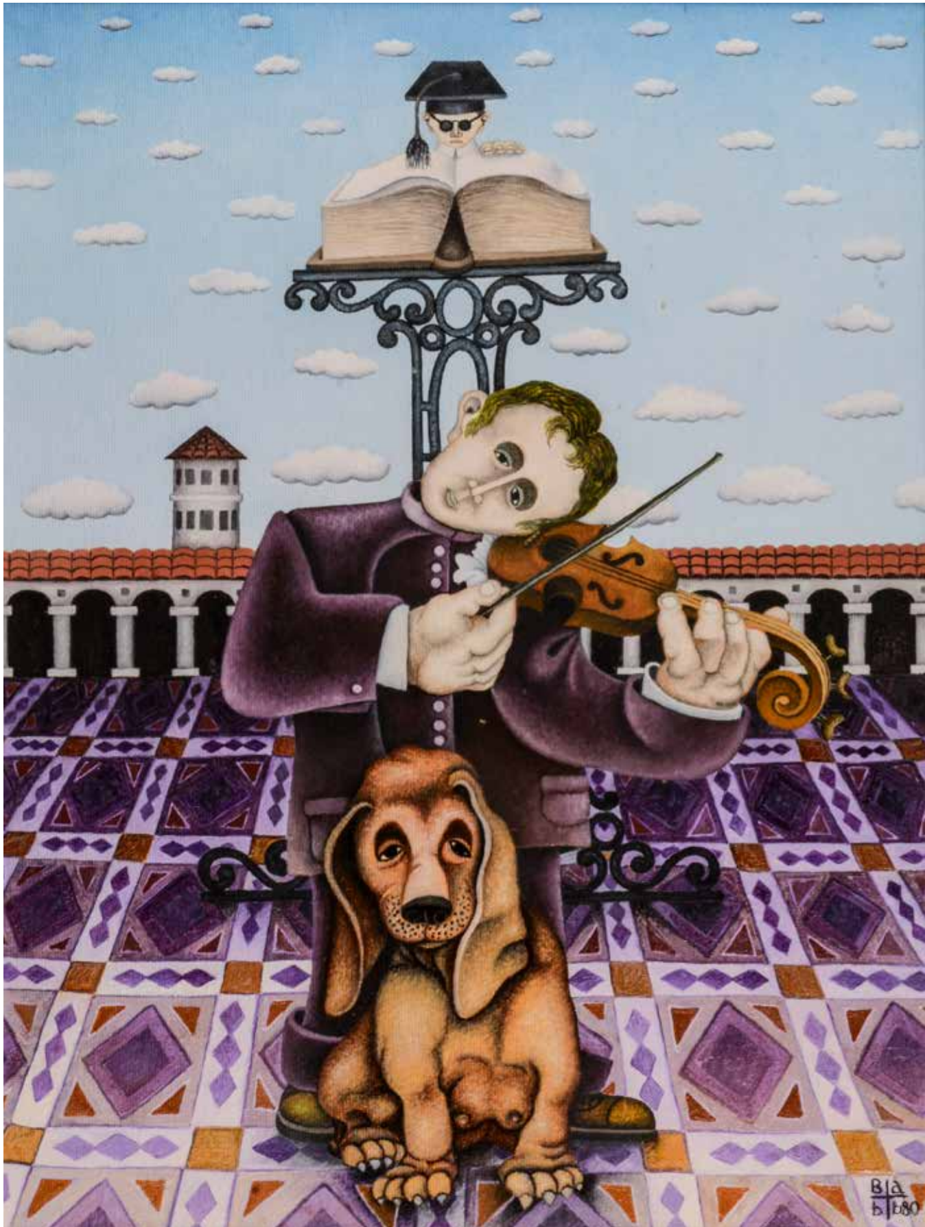
Sviolinata (Played with violin), 1980 oil on canvas 30x40 cm

The violin music is directed at the Judge who is flipping through the Code. Mournful music scene with the dachshund seeming to interpret the melancholy of the scene.