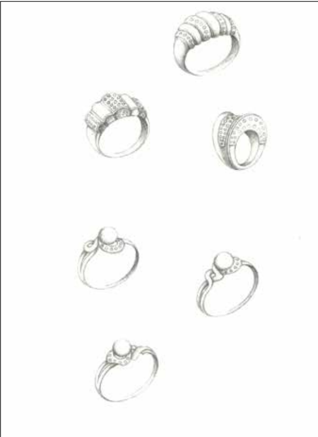
Studies for jewellery (Fabio Neri)