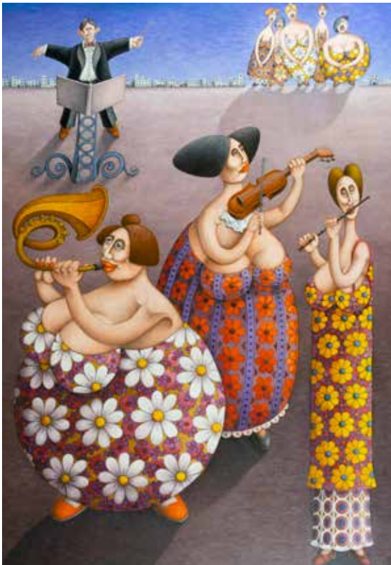
Suonatine (Small Plays), 2003 oil on canvas 70×100 cm (Fabio Neri)