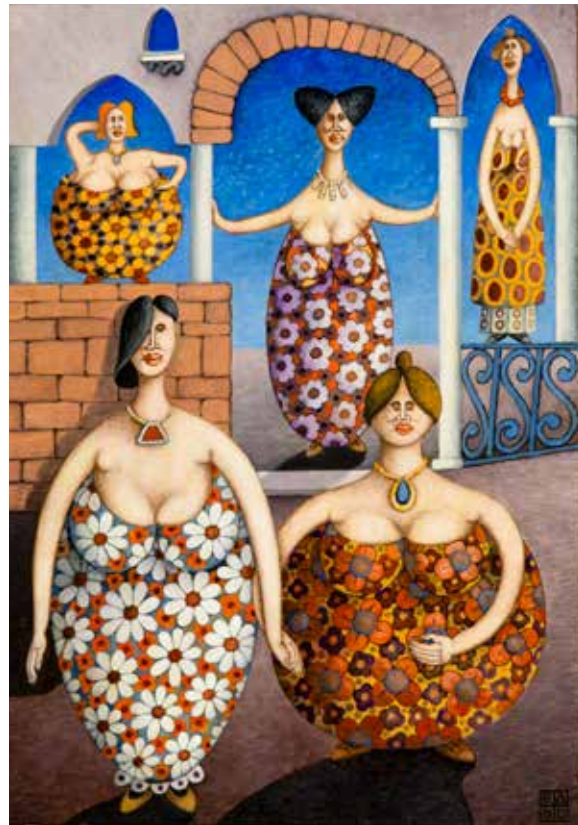
Donne nel portico con gioielli (Women on the porch with jewellery), 2004 oil on canvas 30×40 cm (Fabio Neri)