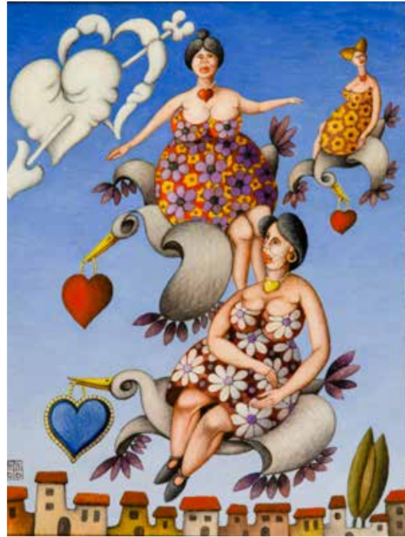
Donne in primavera (Women in Spring), 2005 oil on canvas 25×30 cm (Fabio Neri)