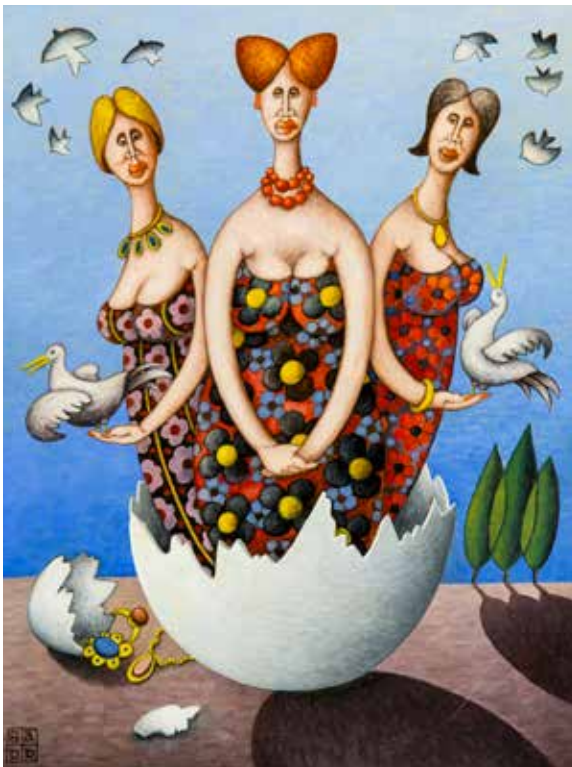
Donne Pasqua (Easter Women) , 2005 oil on canvas 25×30 cm (Fabio Neri)