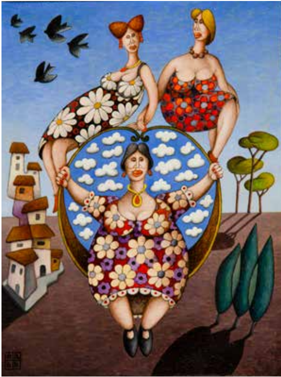
Donne con Gioielli Cometa (Women with Comet Jewellery), 2005 oil on canvas 25×30 cm (Fabio Neri)