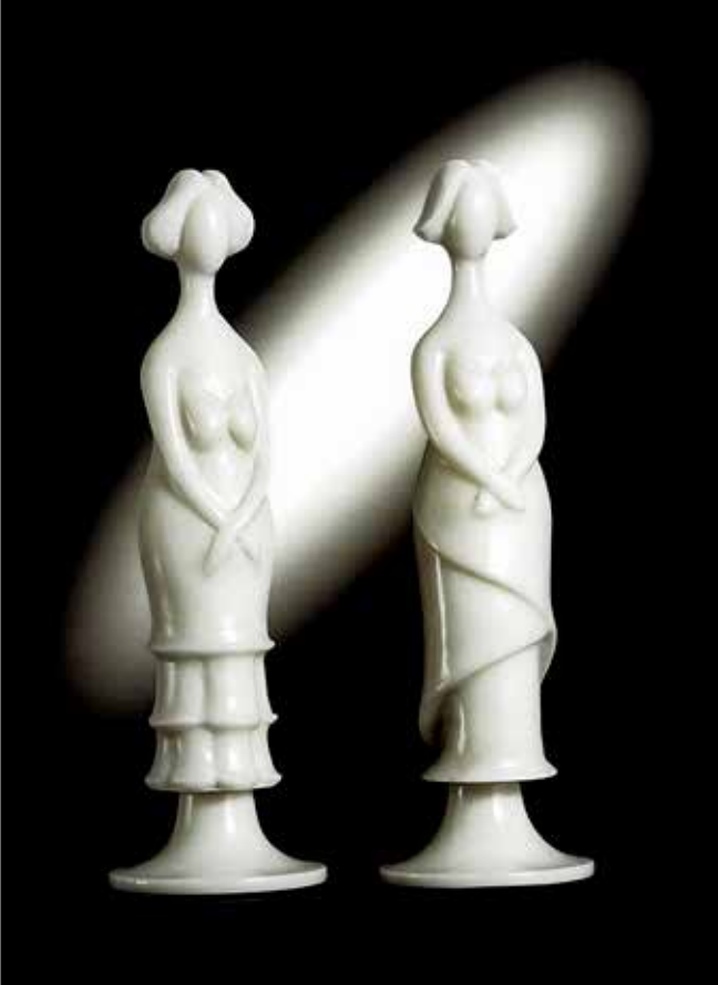
Marble sculptures (Fabio Neri)