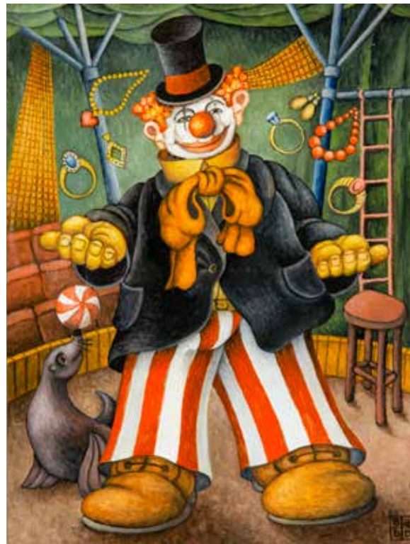
Pagliaccio con gioielli (Clown with jewellery), 2010 oil on canvas 25×30 cm (Fabio Neri)