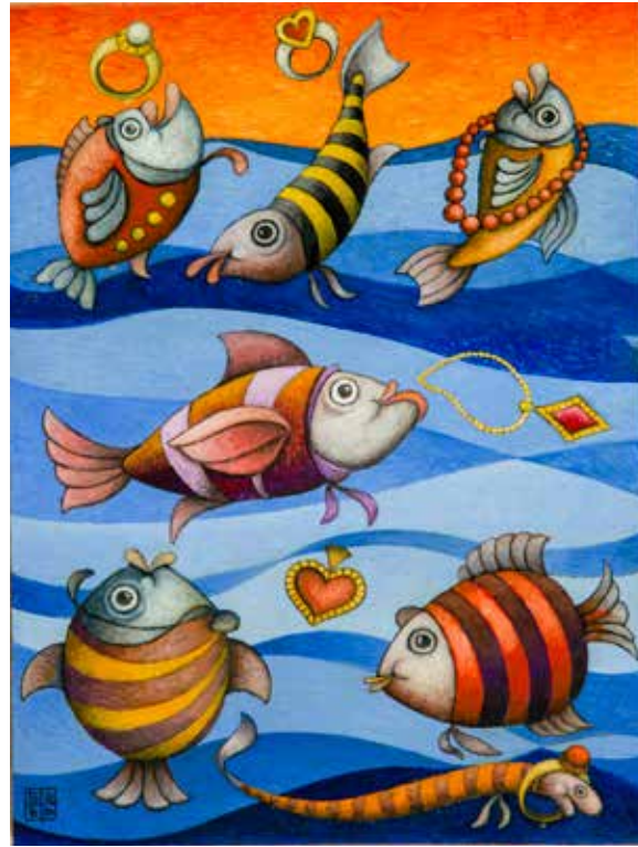
Pesci con gioielli (Fish with jewellery), 2005 oil on canvas 25×30 cm (Fabio Neri)